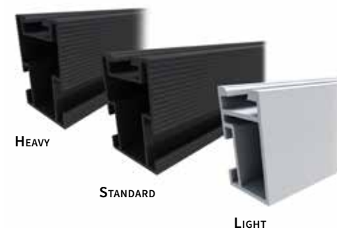
QRails come in two lengths — 168 inches (14 ft) and 208 inches (17.3 ft) Mill and Black Finish

QRail is engineered for optimal structural performance. The system is certified to UL 2703, fully code compliant and backed by a 25-year warranty. QRail is available in Light, Standard and Heavy versions to match all geographic locations. QRail is compatible with virtually all modules and works on a wide range of pitched roof surfaces. Modules can be mounted in portrait or landscape orientation in standard or shared-rail configurations.