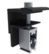
UNIVERSAL END CLAMP

2 clamps for modules from 30-45mm or 38-50mm thick