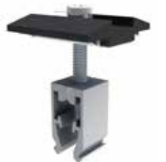
UNIVERSAL BONDED MID CLAMP

2 clamps for modules from 30-45mm or 38-50mm thick